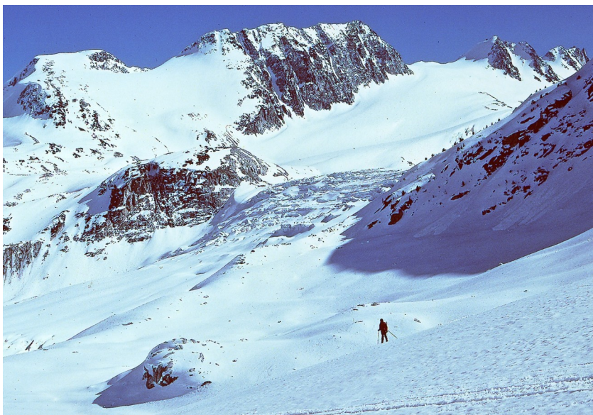
Mount Tait in the Lillooet Icefield.