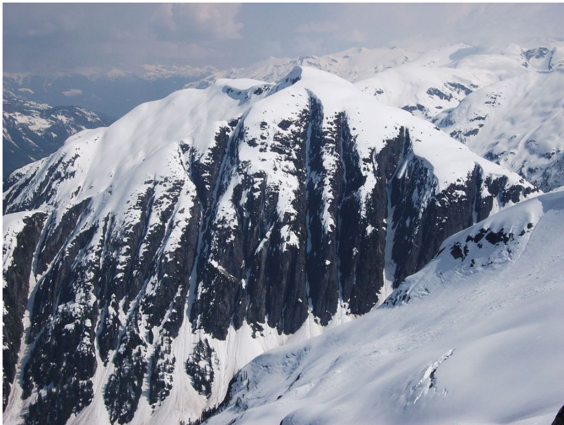
A fierce-looking ridge south of Outrigger.

We got delayed over one hour when one of the party climbed a 20 foot waterfall instead of going around it. It was only three or four hundred metres off the logging road. That was the one difficult section. Would have to grade the trip B4 instead of B3 on account of that one measly section in the gully bypassing the waterfall.