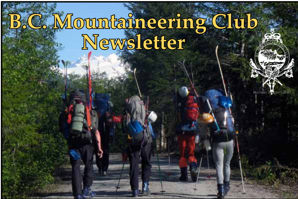
Bootpacking Homathko Main. Mt. Waddington beckons.