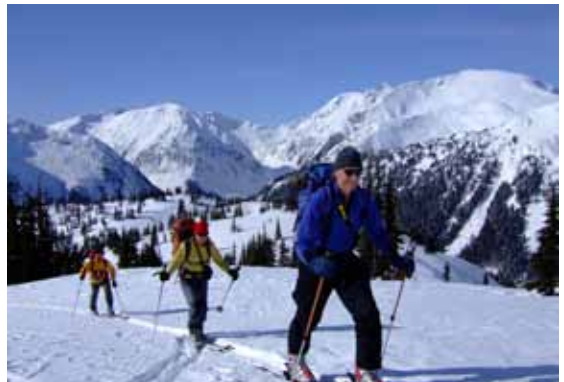
Backcountry access from Shames Mtn. ski area, Terrace, BC.