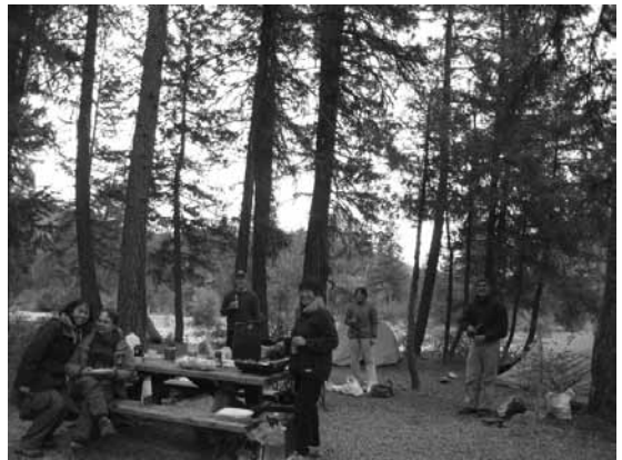
Ain't life tough!