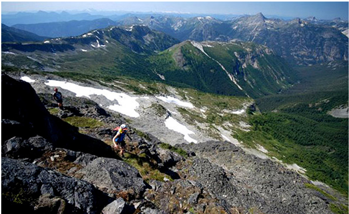
On Coquihalla Mtn.