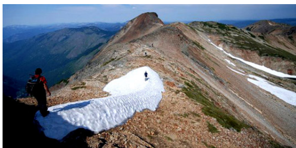
From top, clockwise – heading for Coquihalla Mtn., heading up Tulameen Mtn. (2 photos), flowery meadows near Tulameen Mtn., the group on Coquihalla Mtn.