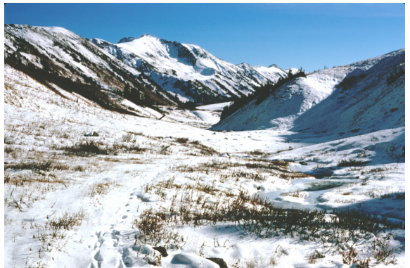
McGillivray Pass on a sunny November day.