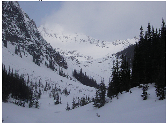
Heading towards Cayoosh Mtn.

After tentatively exploring the traverse onto the northeast glacier in the fog, we decided to retreat to the lake below. As we turned around, we met Isabel Budke and Steve coming over from the pass that leads to the Marriott Basin cabin. They had camped at the low point on the ridge that forms the east side of the Cayoosh valley. This ridge crest also forms the head of Seven Mile Creek valley. Back at the lake, Peter and I decided to check out option 2. We proceeded to the toe of the glacier and up the obvious ramp to the point close to where we would connect to our first option route. The ramp however was sufficiently steep that we had to boot track up and down. Both routes work but have their disadvantages.