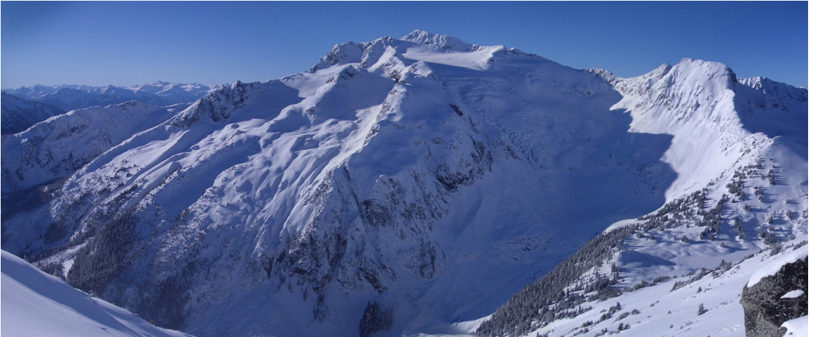
Cayoosh Mtn. from the NE.

grabby. The north sides of the lower gunnels of the glacier provided the best skiing. We arrived back at our camp after 4 pm. From here Ove and Ilze had to leave as they had joined us only for the day. Overnight did not bring the snow as forecast so we had some hope we could repeat a ski ascent via the northeast valley. Peter, Silke, Greg, Chilko and I left camp under overcast skies and started up the valley past the east glacier run out. Travel up the valley forest to the north was easy going. Within a short time we were in the open heading up the valley, which was now bending around to the west.