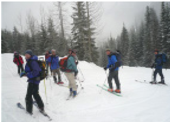
Fun on Silverdaisy Mtn.