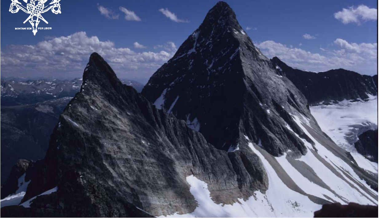
Uto Pk. and Mt. Sir Donald, Glacier National Park.