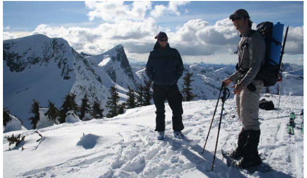
Nak and Thar pks. P. 11 - Nak and Yak pks.