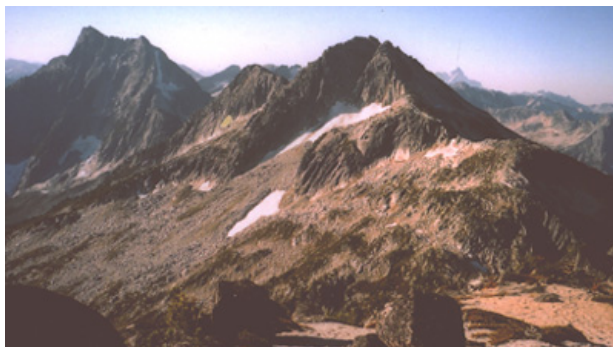
Mt. Lindeman as seen from MacDonald.