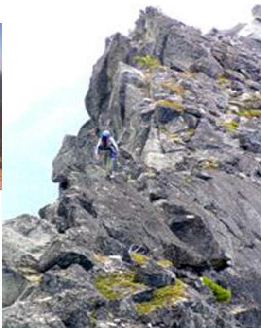
Crossing the ridge from the centre to the south peak of Mt. Lindeman.