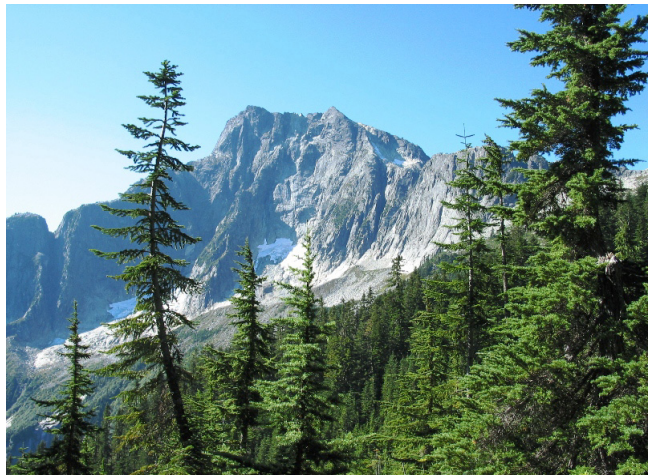
Mt. Lindeman (see p. 7).