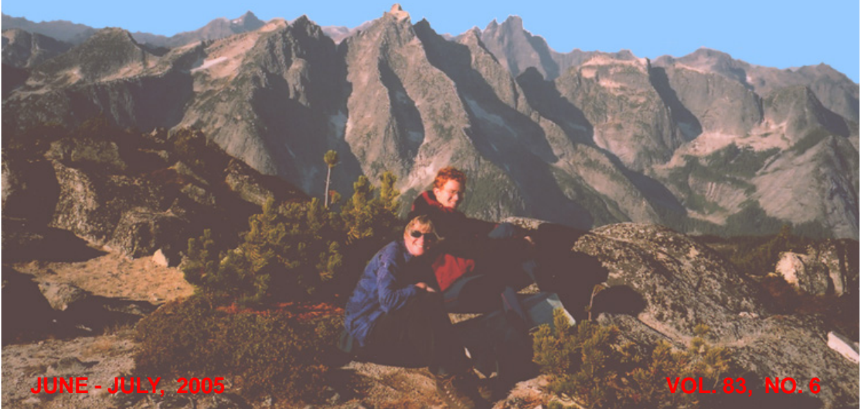
Chilliwack valley mountains.