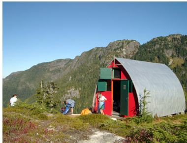
Mountain Lake cabin.

This leisurely family camp will involve hiking in to the club cabin at Mountain Lake, near Sky Pilot, above Howe Sound. It will occur over the July long weekend.