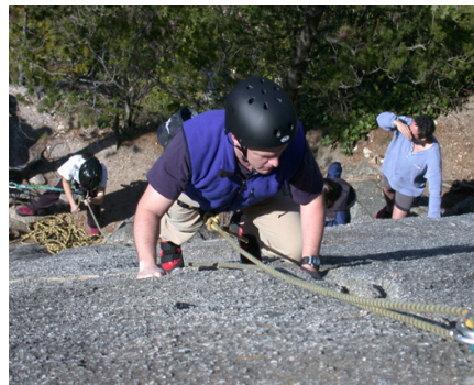
On Squamish rock.