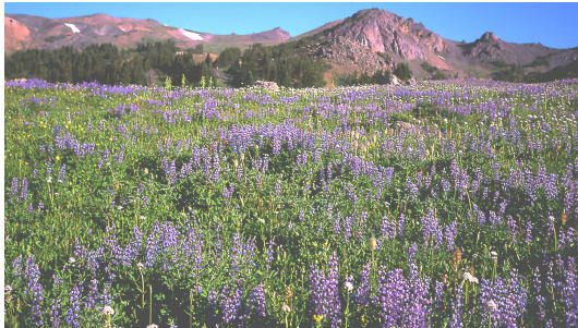
Southern Chilcotin scenery.

For further information, contact Karl Ricker at 1-604-938-1107.