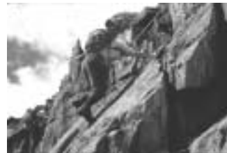
Mountain rock in summer