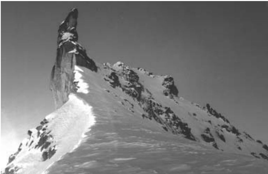
Approaching Mt. Fee from the east.