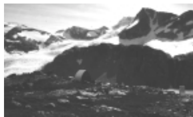
Wedgemount Cabin and adjacent area, August 1971