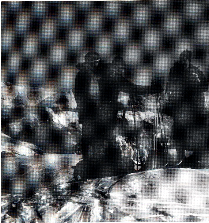
The summit of Mt. Steele in winter.

ADDRESS: P.O. Box 2674 Vancouver, B.C., V6B 3W8 INTERNET SITE: http://www.bivouac.com/bcmc/